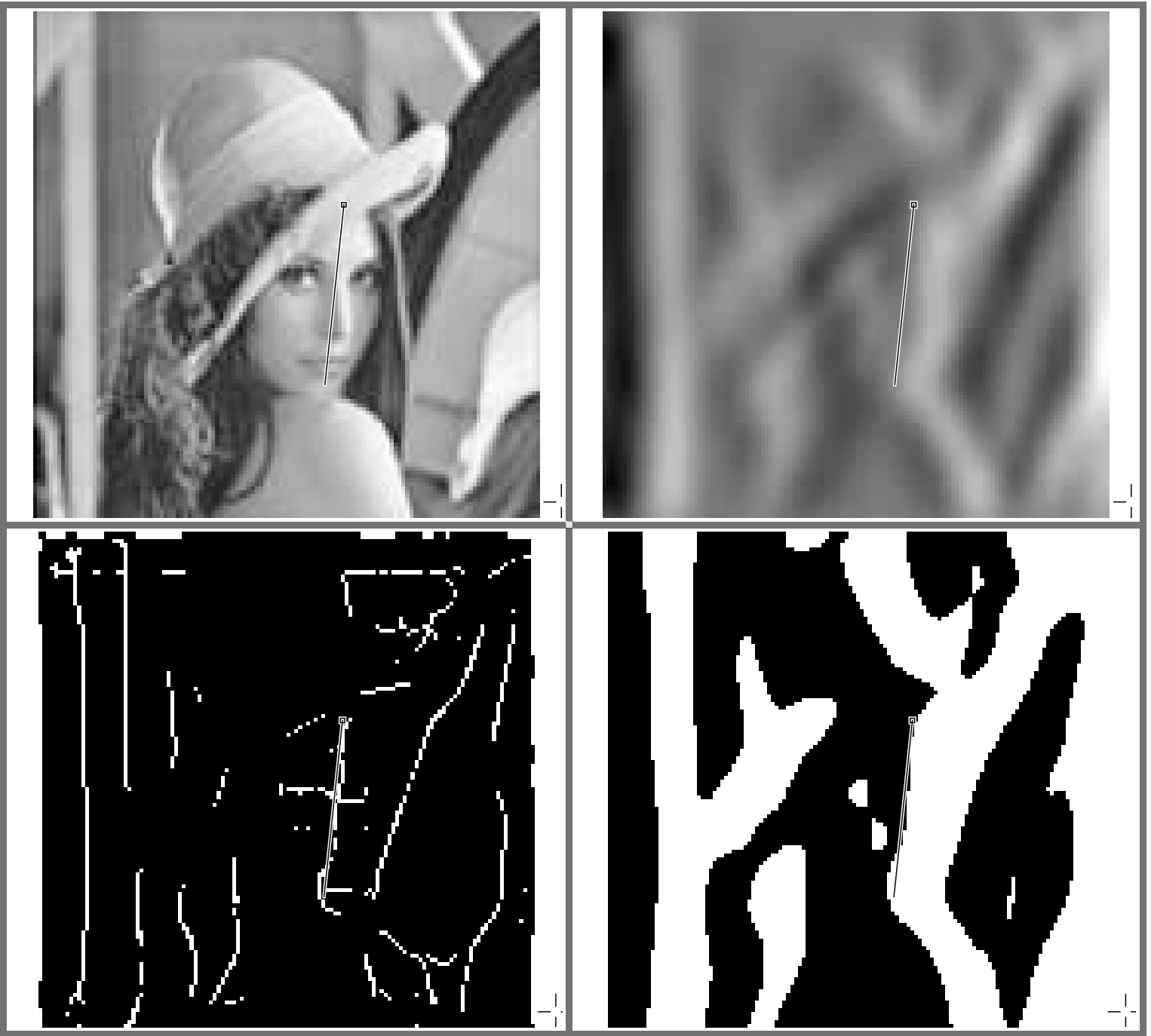
Top left: Lenna image 2 reduced. Top Right: d/dx image. Bottom left: the detected bilateral symmetry Bottom right: d/dx showing the zero crossings.