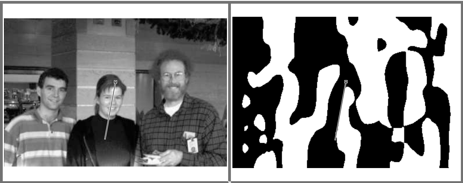
Left: Image, Right: x derivative thresholded