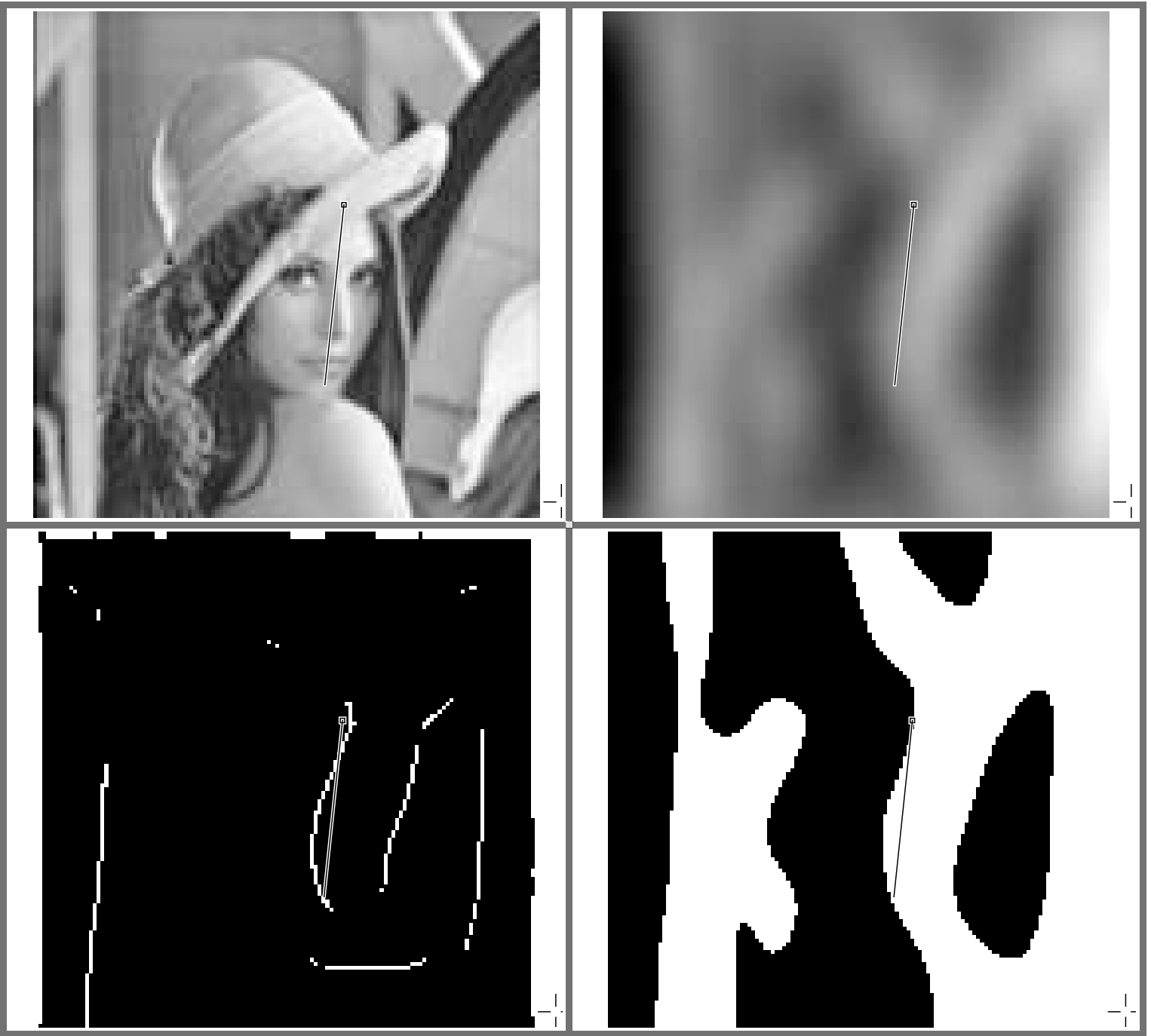
Top left: Lenna image 2 reduced. Top Right: d/dx image. Bottom left: the detected bilateral symmetry Bottom right: d/dx showing the zero crossings.