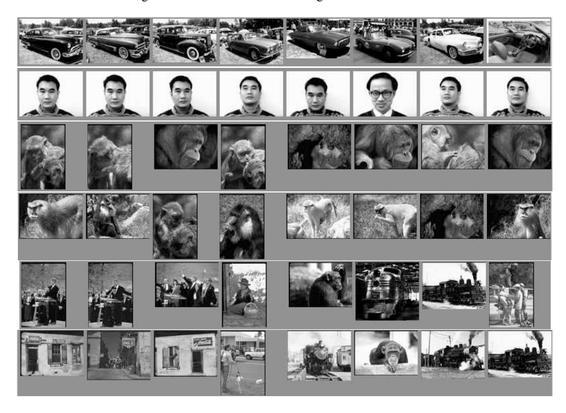
Figure 2: Image retrieval using Curvature and Phase

(also had Coca Cola logos) were retrieved (100% precision), two other very dissimilar images with cocacola logos were not.