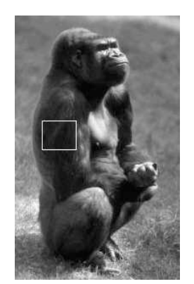
(b) Ape query: The user decides that the texture on the coat is important