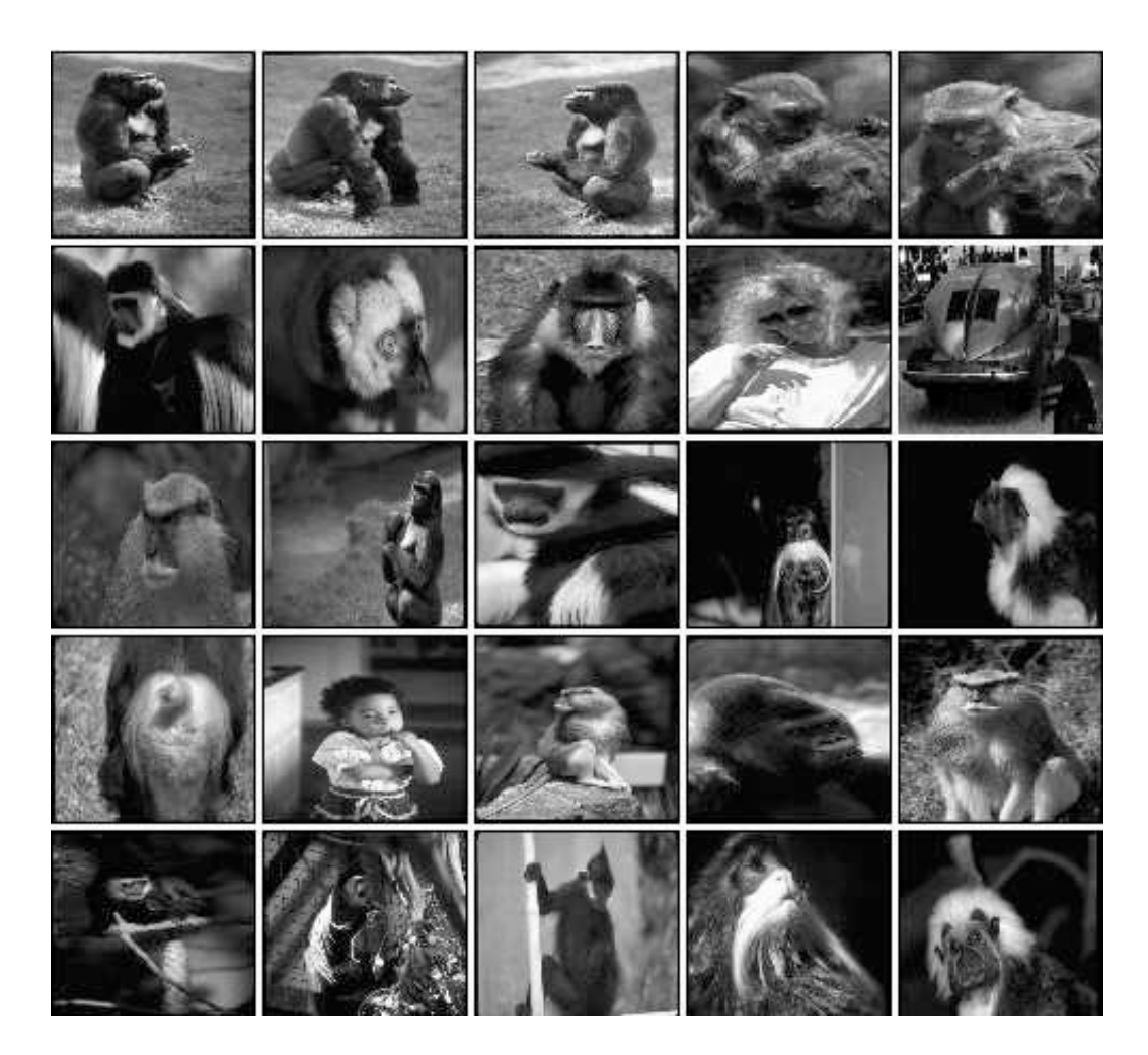
Figure 3. 'Monkey' query results

Unsatisfactory retrieval occurs for several reasons. First it is possible that the query is poorly designed. In this case the user can design a new query and re-submit. Also Synapse allows users to drop any of the displayed results in to a query box and re-submit. Therefore, the user can not only redesign queries on the original image, but also can use any of the result pictures to refine the search. A second source of error is in matching generalized coordinates by value. The choice of scales in the experiments carried out in this case are \frac{3}{\sqrt{2}} , 3, \frac{3}{\sqrt{2}} with the top two invariant vectors i.e. \langle d_3, d_4 \rangle . It is possible that locally the intensity surface may have a very close value, so as to lie within the chosen threshold and thus introduce an incorrect point. By adding more scales or derivatives such errors can be reduced, but at the cost of increased discrimination. Many of these 'false matches' are eliminated in the spatial checking phase. Errors can also occur in the spatial checking phase because it admits much more than a rotational transformation of points with respect to the query configuration. Overall the performance to date has been very satisfactory and we believe that by experimentally evaluating each phase the system can be further improved.