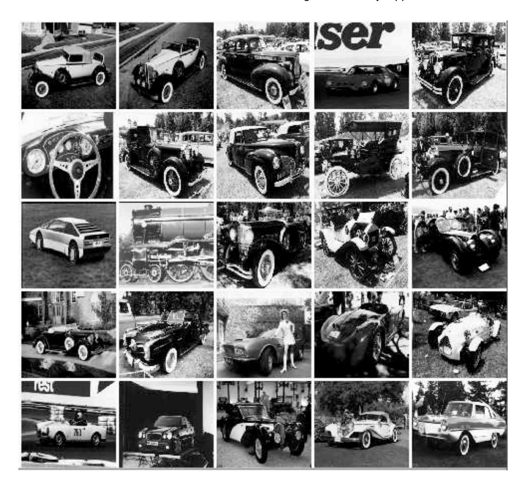
Fig. 2. The results of the car query shown in Figure 1

extracted. After all the k fields complete their search successfully, k generalized coordinates would have been extracted. If all of these are exactly the same then the find-by-value routine has succeeded.