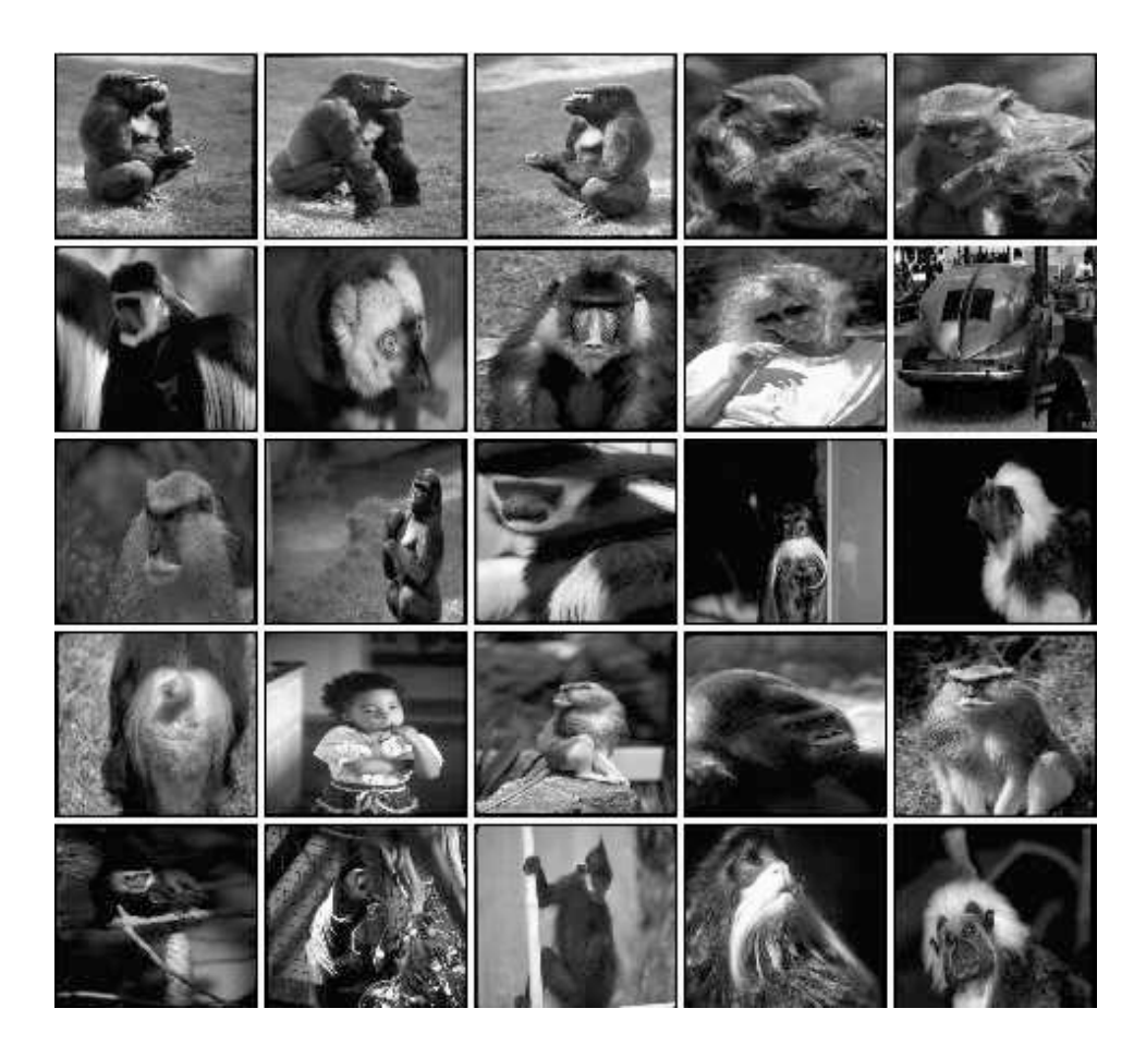
Fig. 4. 'Monkey' Query Results